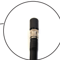
Oral Inflation Tube