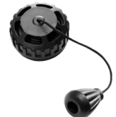
Over Pressure Valve LR-SP1.11