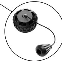
Manual Air Dump / Over Inflation Valve

* note that the actual bladder is black.