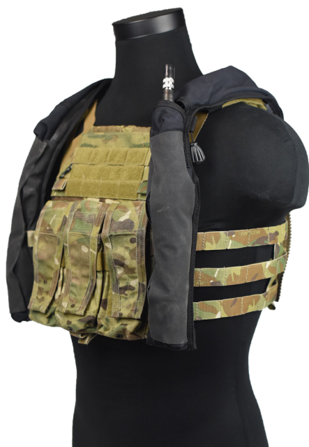
Crye JPC 2.0 / AVS