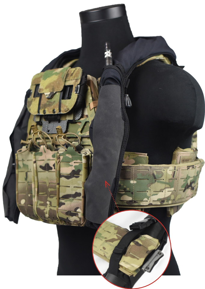
PlateFrame-Modular™ - PF-M ™