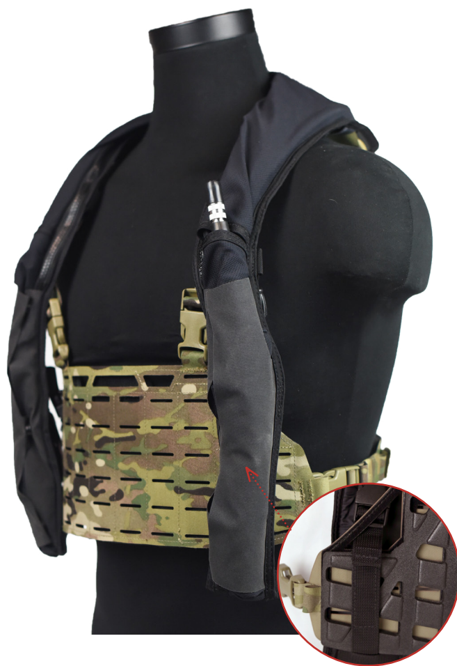
Chest Rig-Modular™ - CR-M ™