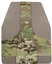
shown without Multi-Cam SOC FRONT