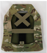
optional Multi-Cam SOC (PFS-S001XX) BACK

4 Fold down top Velcro strap. Fold up bottom Velcro strap. Pull to create a tight connection.