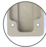
Small screws increase friction and reduce rattle