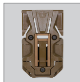
GRT™ REINFORCED WEBBING ADAPTER