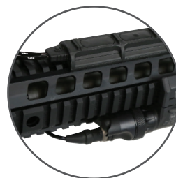
Optional Surefire® Remote Dual Switch