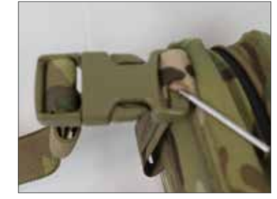
TIP: use small screwdriver to squeeze loop if more pressure is needed.