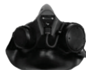
Airborne Systems SOLR