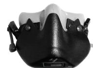
Airborne Systems N.A. (PHAOS)