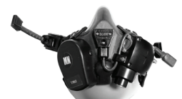
Carleton Phantom Mask Assembly