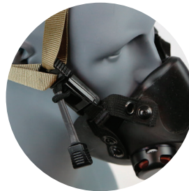
Right side features a quick release buckle