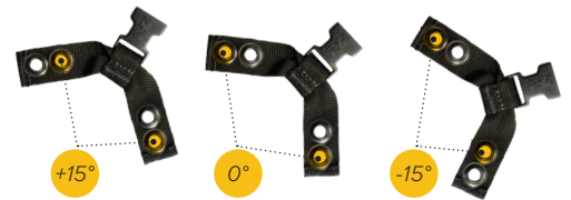
Attach the mask buckle using variations of inner/outer grommets to adjust mask in 15 degree increments.