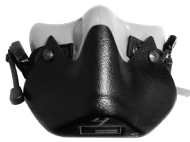
Airborne Systems N.A. (PHAOS)