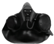
Airborne Systems SOLR