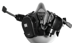
Carleton Phantom Mask Assembly