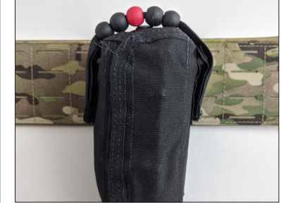
Tuck the stiffened tabs back into the MOLLE/PALS row to secure the adapter and PECI in place.