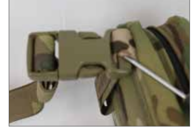
TIP: use small screwdriver to squeeze loop if more pressure is needed.

Slide the first half of the З split buckle into the top loop. Squeeze the loop to fit over the other side of the split buckle. Repeat with other 3 straps.