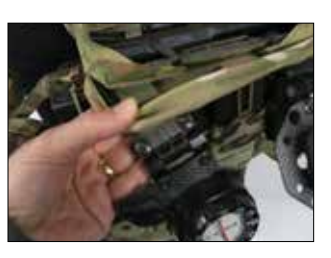
Locate slot under FlipLite<sup>™</sup> and insert accessory strap.