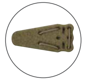
PTT Wings for Cable Management