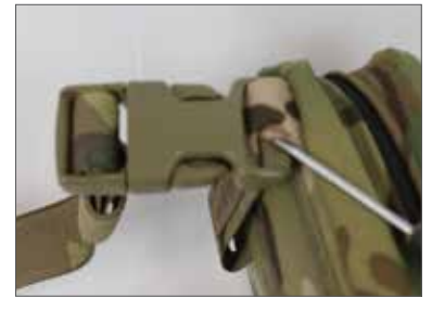
TIP: use small screwdriver to squeeze loop if more pressure is needed.