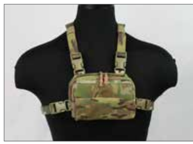
Attach strap buckles to split buckles and adjust to fit.