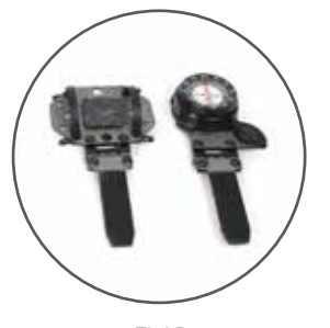
FLAP (FlipLite™ Accessory Pack)