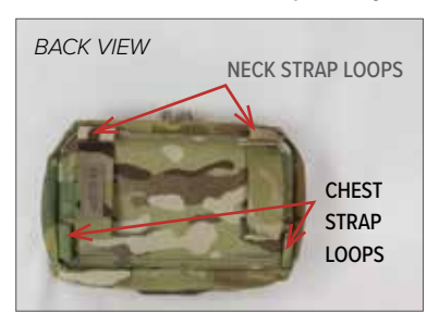
Locate 4 loops on the back of the ZipFlip Pouch. Top 2 connect the neck strap and the bottom 2 connect the chest strap.