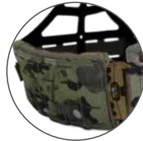
Auto-Fit Cumberbund™ offers superior fit and comfort