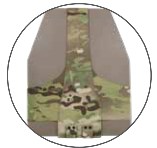
Ballistic plates can be integrated via Armor Harness