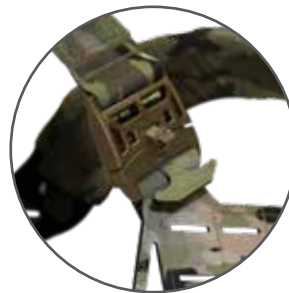
Polymer Quick-Release buckles