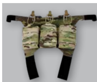
3 MAG POUCH RAP Rapid Attachment Panel (RAP)