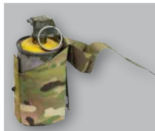
SMOKE GRENADE POUCH