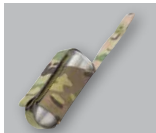
SINGLE 40MM POUCH

The OSS Redux is a series of minimalistic and practical set of pouches designed to be paired with our PF-R™, yet versatile enough to be used with any of our carriers or standard MOLLE/PALS webbing system. This series is constructed of light-weight, hydrophobic material that is durable, long-lasting and will shed water to reduce weight in wet environments.