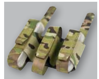
TRIPLE 40MM POUCH