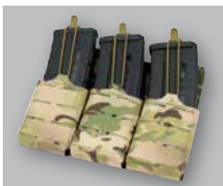
TRIPLE M4 Single & Double Also Available