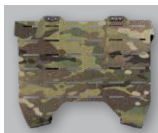
HALF RAP Rapid Attachment Panel (RAP)